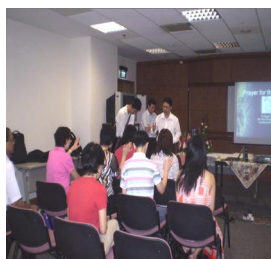
Praying over medical students