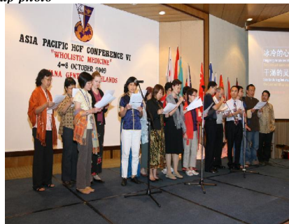
Singapore/China/Taiwan performing together